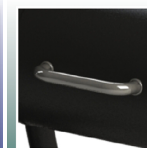
Heavy Duty Handles