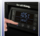
Digital Control Display with Smart-Touch System