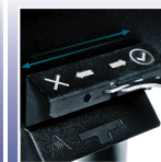
Burn Pot Agitator